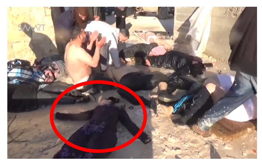
The woman's body. She is dressed, in spite of many other injured people are undressed. No one touch her.

There were almost no women among the victims of the attack. The most of injured people were men and children, and all the women were dead. If the footage was fabricated, it can be assumed that there were no women at the pictures, because according to Muslim tradition a man mustn't touch women.